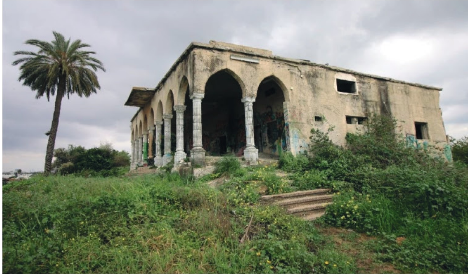
The depopulated village Al-Qubayba , near Ramla . The owner of the house was expelled to what became the Gaza Strip.

Photographic exhibition: Palestine, the past that defies the colonial presence