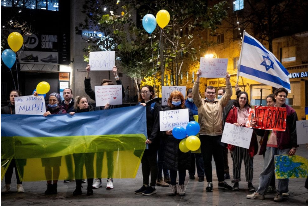
Israelis demonstrate against Russian occupation in Ukraine.

This email was sent to tucsheffield@gmail.com