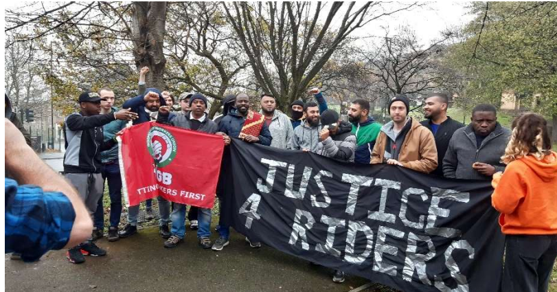
IWGB Just Eat riders start strike action against pay cut on 6 th Dec

We have been proud to support the longest gig-economy strike in the country when IWGB couriers working for Just Eat/Stuart Delivery staged strike action in Sheffield. These mainly Black, Asian and ethnic community workers have never been organised before but were determined to fight back against a cut in the minimum delivery payment from £4.50 to £3.40, implemented on 6 th December 2021. The dispute is ongoing.