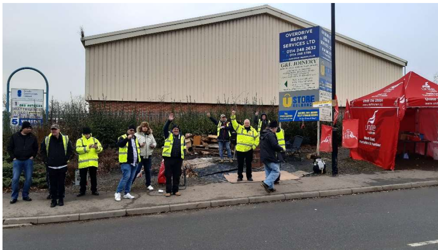
UNITE Stagecoach drivers on the picket line outside Halfway depot

The biggest strike action of 2021 was UNITE’s Stagecoach drivers’ dispute which saw 3 one-week strikes at the end of 2021 and start of 2022 across all 4 depots in South Yorkshire. The drivers at the two Sheffield depots were on the lowest pay for bus drivers in the whole region. We supported the strike with press releases and media interviews and attending their picket lines. The final settlement was overwhelmingly agreed by the drivers in a ballot in January 2022 and represents a huge victory for UNITE.