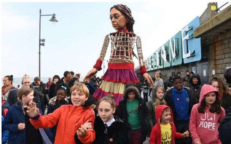
Little Amal is borne aloft to be carried through the streets

It was decided in April to go ahead with a May Day rally to mark International Workers Day, assembling at Devonshire Green at 1230 for 1pm in conjunction with Sheffield Against the Policing Bill for the National Day of Action "Kill the Bill", then a march to Barkers Pool for a May Day rally with speakers on City Hall steps.